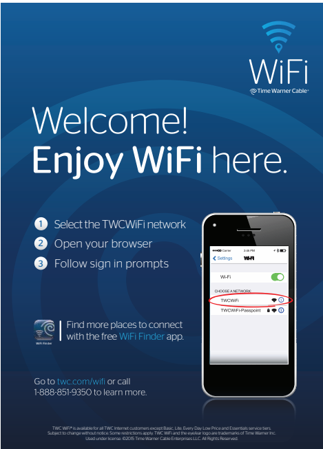
Easel Back Sign