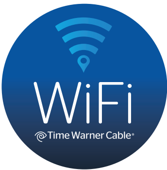
Removable Double-Sided Window Decal