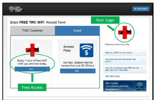
Length of Connection